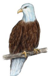
American Bald Eagle

It has a sharp, hooked beak to tear flesh from birds, small mammals and even reptiles.